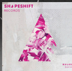
Navia - Rules (14-10-2022)